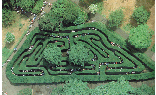
The real maze at Hampton Court

A labyrinth is a very common structure in many types of games. It is also a perfect illustration of the difference between a game object and a fictional object. Labyrinths exist in the real world, in fictions, and in games, from Pac-Man to The Chronicles of Riddick: Escape from Butcher Bay . A very famous real-world labyrinth would be the hedge maze at Hampton Court, England. A similar but fictive labyrinth is the one we find in Kubrick's movie The Shining , outside the spooky Overlook hotel. Kubrick's labyrinth looks real, but as we shall see, is completely fictional. The Pac-Man labyrinth, however, does not look like a real-world labyrinth, unless we consider that labyrinths do not have to be made of wood, stone or a planted hedge. Labyrinths, made by humans since before recorded history, are also painted designs that could be on a wall, a page, a floor or a computer screen. Some are knee-deep, some are 10 feet tall, some are outdoor, some are indoor, and some are found at the backs of comic books or in weekly magazines.